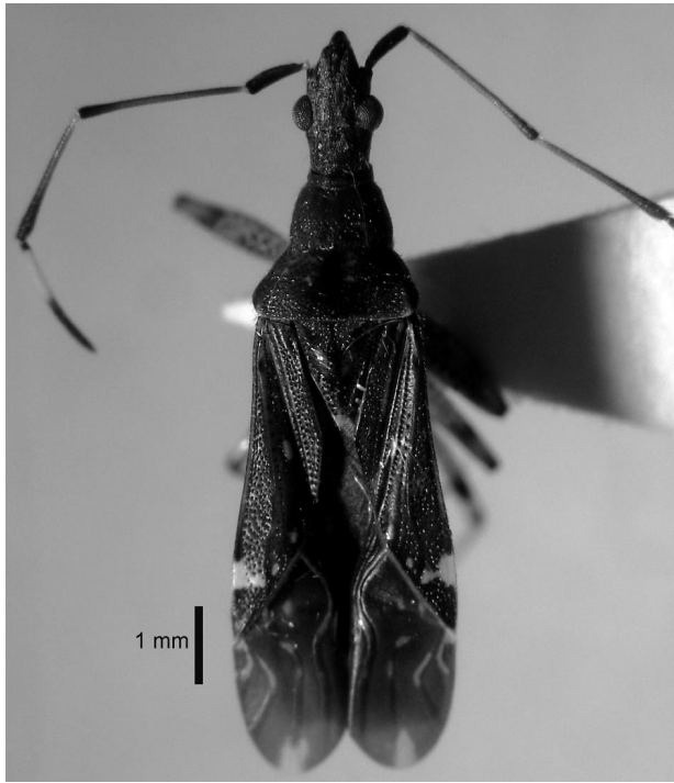
Figure 1. Catenes australis sp. n.; habitus of male.