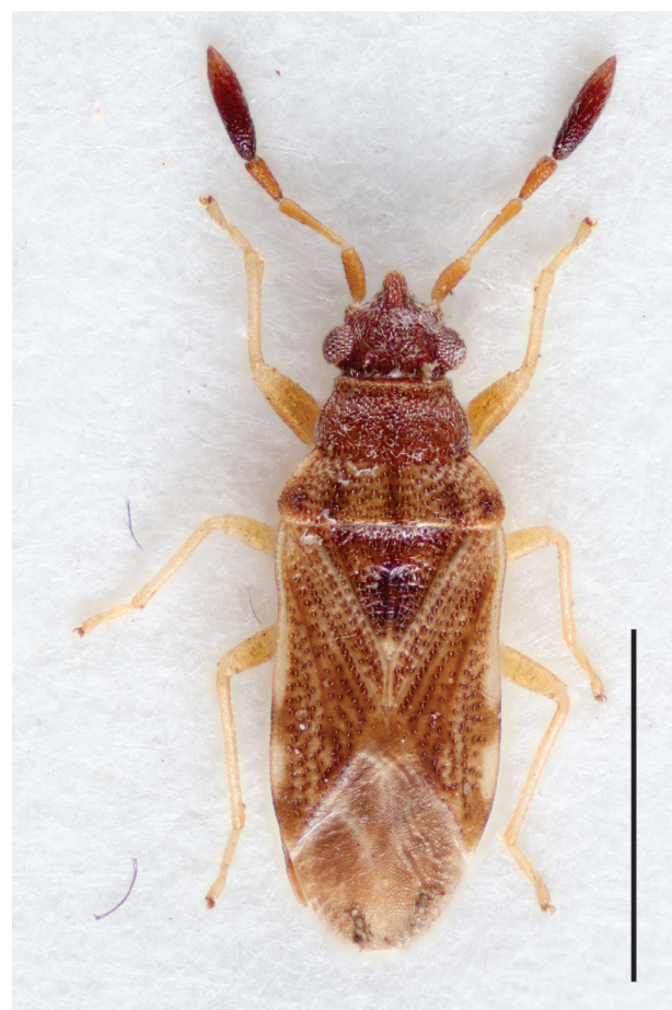
Figure 1. Malleusocoris minimus gen. nov., sp. nov. Habitus of male holotype. Scale bar: 1 mm.